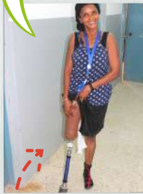
"THROUGH KNEE" PROSTHESIS