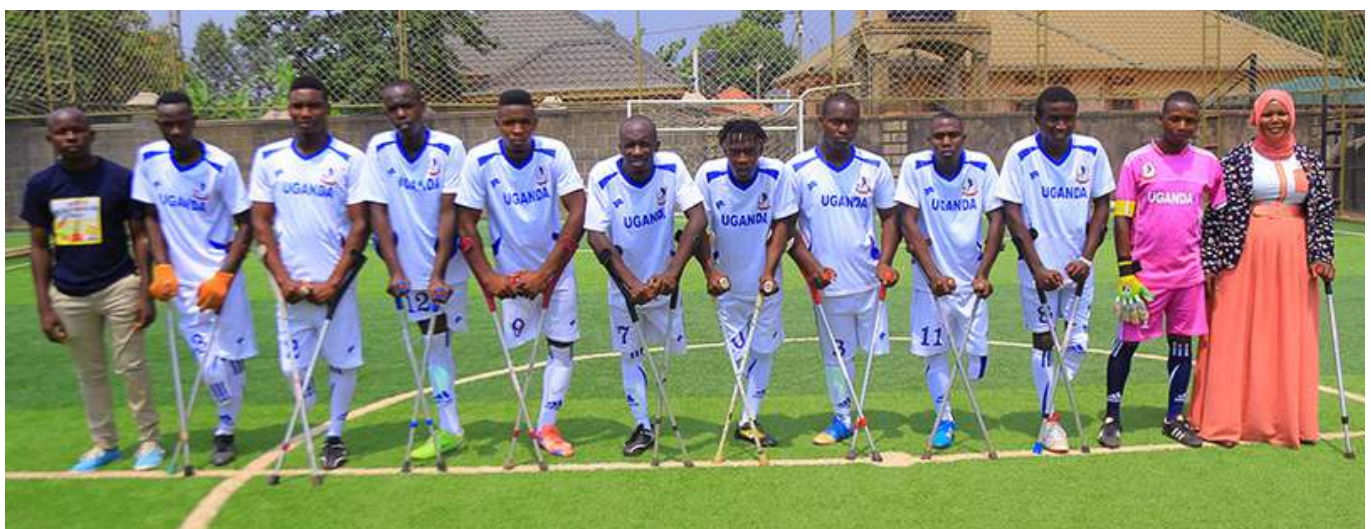
Federation of Uganda Amputee Football Association (FUFAFA) team