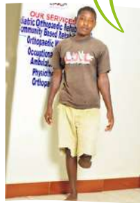
PROSTHESIS IN PRODUCTION

26 years old, transtibial amputee due to a road accident