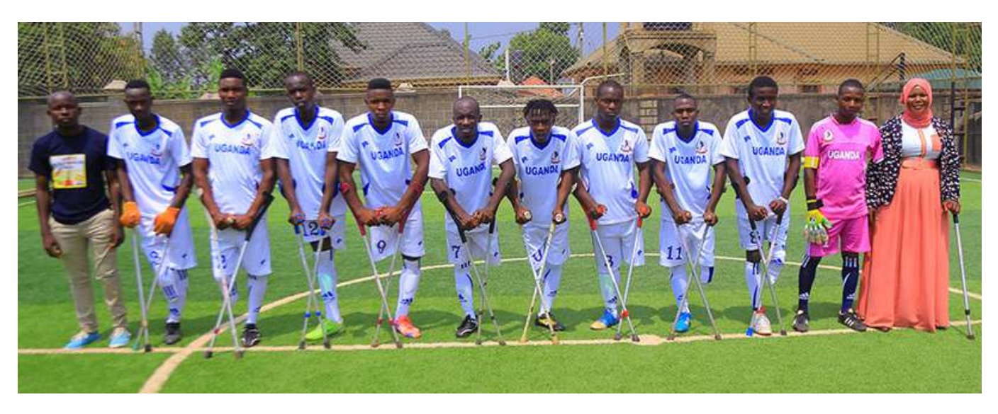
Federation of Uganda Amputee Football Association (FUAFA) team