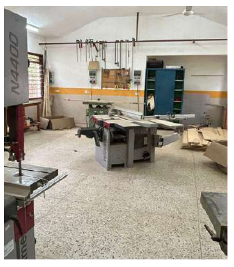
OVCI and its rehabilitation centre active in the production of orthotics