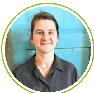
BERLÉ EDWARDS Orthopedic centre in the Gauteng Province, South Africa