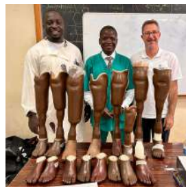
The final products, ready for fitting