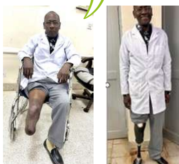
MODULAR PROSTHESIS WITH ALVIO TECHNOLOGY

62 year olds transtibial amputee due to diabetes