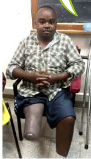
MONOLIMB PROSTHESIS (awaiting pickup)

33 years old, transtibial amputee due to a traffic accident