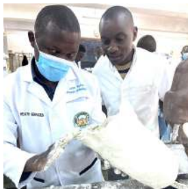
Making the mould