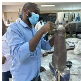
Working on a Monolimb