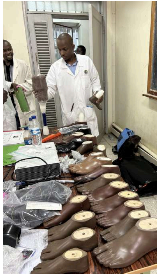
Feet lined up for attachment