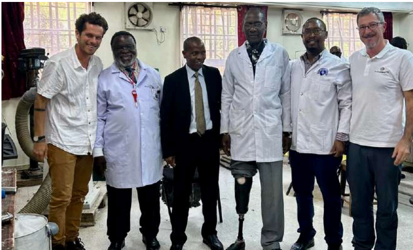
Some of the leaders making a difference in rehabilitation in Kenya